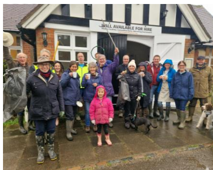
Let the clean-up commence! Young, older and four-legged friends get ready to pick

Braving less than clement weather but lured by an offer of hot drinks and bacon rolls, volunteers donned wet weather gear and stayed smiling. With routes assigned and bin bags in hand – Hi-Vis jackets are optional but always professional looking! Our eagle-eyed pickers soon got to grips with Frieth's roads, verges, hedgerows and paths. Thank you to all who joined in the fun.