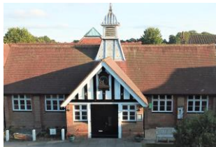
Village Hall £450