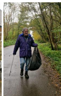
On the lookout for discarded £50 notes