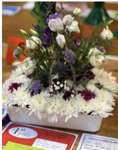
Flower & Produce Show £100