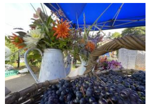
Lady Ryder Memorial Garden £100

The Frieth Village Society is delighted to let you know that our Village Fête raised a surplus of more than £1,700. As a result, the following donations have been made to benefit our local community: