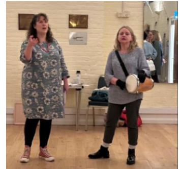
AND there's a drummer!