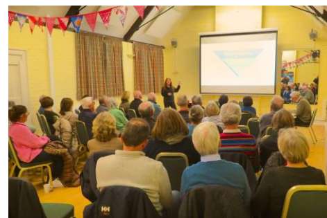
Much interest from Frieth's residents