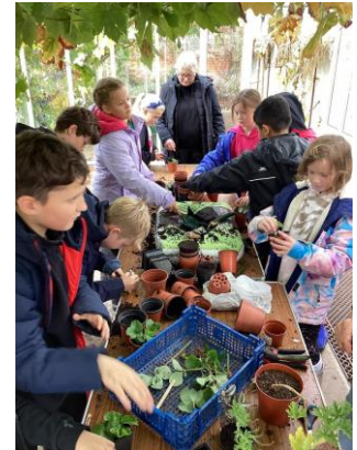
Young gardeners from Frieth School busy at Parmoor

While many of us know of the weekly 'in season' produce stall which runs at the garden, the support provided for the Frieth Fete and the Flower & Produce Show, you may be less aware of the sterling work done by the team in support of education, especially for those with special educational needs and disabilities (SEND). With much pressure on SEND funding, the availability of the garden's facilities, free of charge, to Chilterns Wood, Stony Dean and Alfriston Schools, as well as adults from "Talkback", has been very gratefully received and has clearly benefitted many individuals. Similarly, each class from Frieth's Primary School has visited the gardens, with sessions planned to fit in with the curricula, providing both learning opportunities and great enjoyment to those attending. Maybe these will be the volunteers of the future, continuing this great work, and knowing that should they take up their trowel and fork in the future at the LRMG, they can be sure of a tea break to surpass all others!