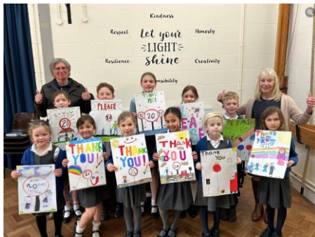
Just some of the winning entries