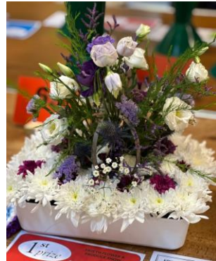
These are... flowers