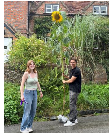
Last seen heading for Lane End

We welcome all your feedback, thoughts and ideas, email: friethnewsletter@yahoo.co.uk