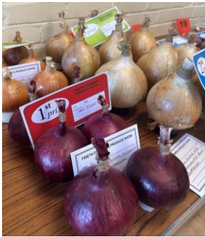
When you know your onions

Congratulations to the winners, runners-up and 'not-winners' of the annual food and produce show. As usual, the artfully chosen magnolia palette of the village hall formed the perfect backdrop to the riot of colour we have come to expect.