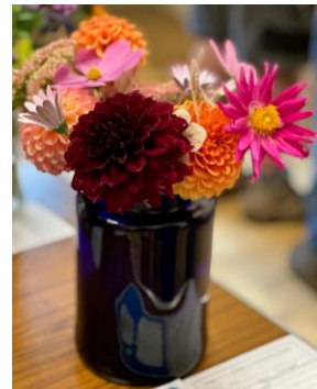
Hey, slugs? - can't touch this