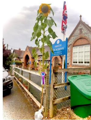
This one got 'high' praise from the judges