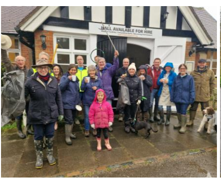
Let the clean-up commence! Young, older and four-legged friends get ready to pick

Braving less than clement weather but lured by an offer of hot drinks and bacon rolls, volunteers donned wet weather gear and stayed smiling. With routes assigned and bin bags in hand – Hi-Vis jackets are optional but always professional looking! Our eagle-eyed pickers soon got to grips with Frieth's roads, verges, hedgerows and paths. Thank you to all who joined in the fun.